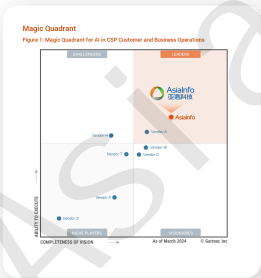
Leader in the Gartner Magic Quadrant for AI in CSP Customer and Business Operations, 2024