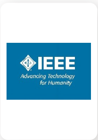
2023 IEEE International Standards