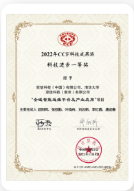
First Prize of CCF Science and Technology Progress Award