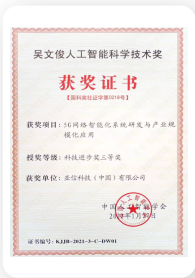
Wu Wenjun Artificial Intelligence Science and Technology Award