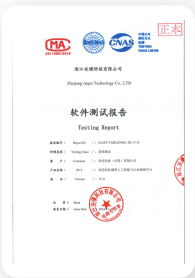
CNAS Test Report